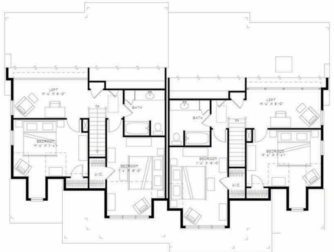
SECOND FLOOR PLAN 723 S.F. PER UNIT REV. DATE: 3-15-11

PINE STREET DUPLEX NORTH FALMOUTH, MA THE VALLE GROUP